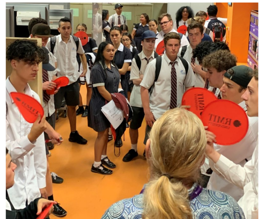
Year 12 VCAL students