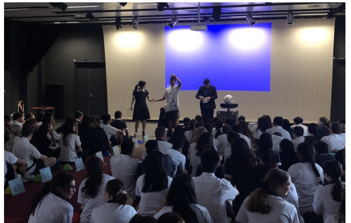
The Magic Show

Thank you very much to all families who attended the evening as it was a great success.